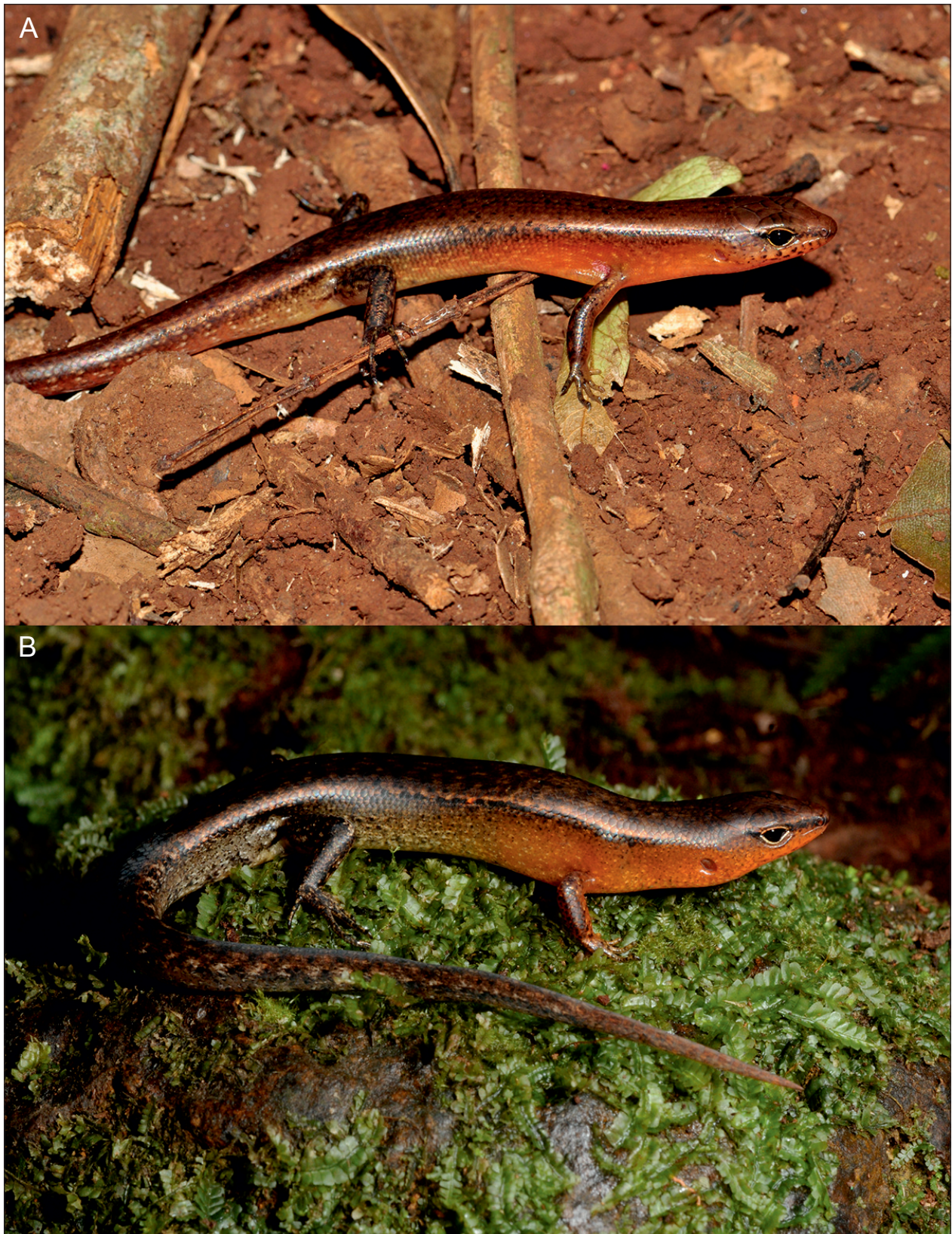
Fig. 2 Sphenomorphus buenloicus in life: A) adult male from Phnom Namlyr Wildlife Sanctuary, Mondulhiri, Cambodia; B) adult male from Kon Chu Rang Nature Reserve, Gia Lai, Vietnam.